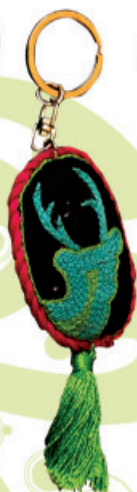
Product Code SKC03