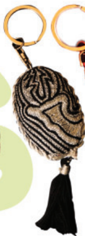
Product Code SKC04