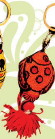
Product Code SKC02