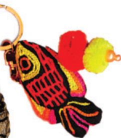
Product Code SKC05