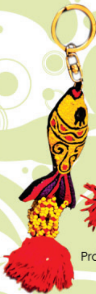
Product Code SKC01