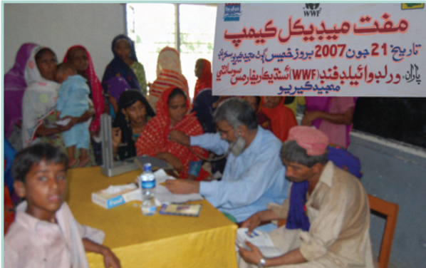
Medical Camp in Sakrand, Nawabshah

In total, 780 patients belonging to 42 villages of Taluka Sakrand were treated at the camp. Most of the villagers who took part in the camp belong to villages within the 10 kilometre area of Pai Forest. The camp was divided in 7 different sections catering to the needs of patients with different ailments. The included Paediatrics ; General Physicians; Ear, Nose and Throat; Blood screening (Hepatitis B & C); Medicines; Tubercloses (awareness); and Gynaecology with ultrasound facility.