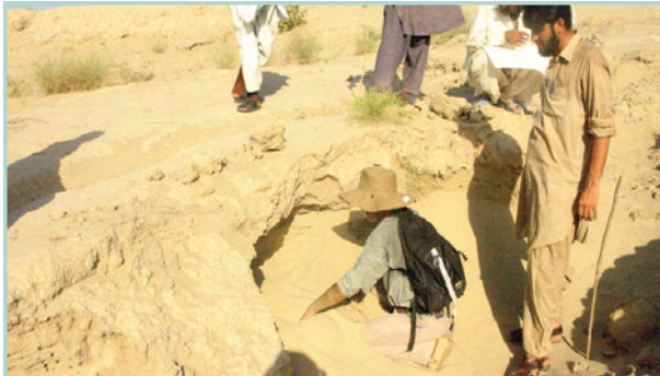
Herpatologist collecting samples in Chotiari

The Indus for All Programme has initiated a detailed ecological assessment in the Programme's four sites for the year 2007. A team of consultants, comprising of subject specialists from Pakistan Museum of Natural History, Islamabad, Sindh Wildlife Department, and WWF-Pakistan conducted the detailed fauna survey that also covered an additional site, Keti Shah (a riverine ecosystem in Sukkur). All the sites represent diverse ecosystems situated in the Indus Ecoregion. The survey, conducted from June 10 to 26, 2007, focussed on