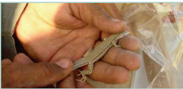
A Lizard species found in Chotiari

The initial summer survey, will be followed by the Monsoon or Fall survey in October 2007 and winter survey in January 2008. These surveys will give a better insight into the biodiversity of the area.