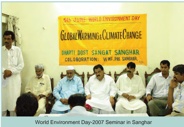
World Environment Day-2007 Seminar in Sanghar

On the same day, the Programme staff visited the Degree College Sanghar, where they briefed the Principal and teachers about the objectives of the Programme with special reference to environmental awareness. Later on, the staff participated in tree plantation activity at the premises of the college.