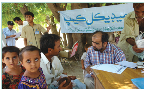
Medical Camp at Chotiari

The PIU Sanghar also used the event to raise awareness among local residents about the importance of natural resources and their conservation. Hence, messages about environment, health and hygiene and conservation-related information were disseminated through banners and other resource materials.