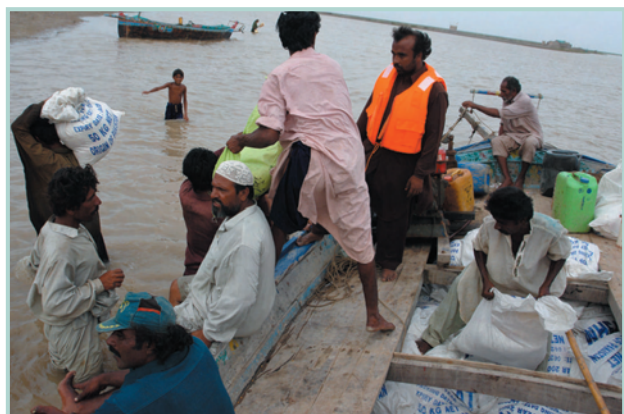
Indus for All Programme's Relief Efforts in Keti Bunder

Beginning from 22 June 2007, a strong Monsoon weather system over the North Arabian Sea swept over the Sindh coastal areas. The weather system then converted into a Tropical Cyclone (Yemyin No.03B). Under its influence, heavy rainfall, winds and extremely rough southwesterly wave action caused rapid destruction of housing in Keti Bunder. This devastated the livelihoods of coastal communities including inland and remote creek inhabitants. Initial estimates found that 5,220 families became homeless in Keti Bunder town alone with 200 improvised thatch huts destroyed and 4,200 partially damaged, 135 boats damaged, half of all poultry and betel leaf sheds damaged, and half of all crops on 500 acres of agriculture land destroyed.