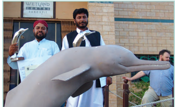
Recipients of Syed Asad Ali Award 2007