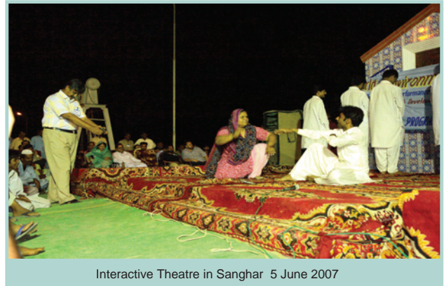
Interactive Theatre in Sanghar 5 June 2007

To mark the World Environment Day - 2007, the PIU Sanghar organised an interactive theatre on the embankment of Chotiari Reservoir on 5 June 2007. Over 2000 spectators including a large number of local community members, district and local government officials and representatives of various NGOs and media personnel attended the event. The theatre performers belonged to the "Jagartaa Group" of Sindh Development Society, a local NGO working on environmental awareness. The event helped highlight biodiversity issues and the negative effects of natural resources depletion on the livelihoods of the local people. Following theatre performance, a musical programme was held in which various folk artists performed. The poetry and songs focussed on various aspects of environmental conservation portrayed in the popular Sufi poetry of Sindh. The event was covered by print and electronic media. This includes news bulletins and articles, in addition to a 5-minute documentary on Indus TV.