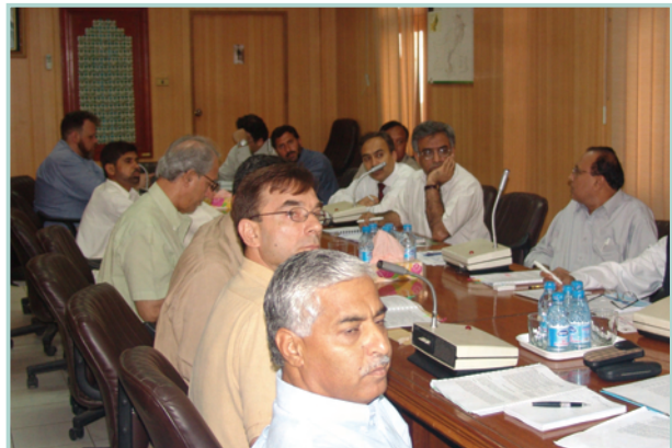
2 nd Meeting of the Indus Ecoregion Steering Committee, 12 April 2007