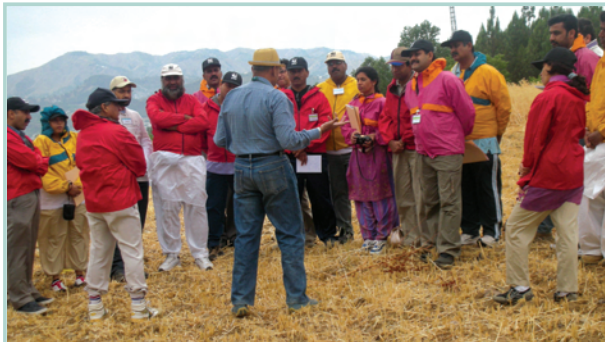
Team-building Exercise in Abbotabad