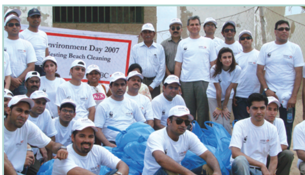
WWF and HSBC staff at Beach Cleaning Activity

Pakistan is a signatory to the IOSEA Agreement on conservation of marine turtles.