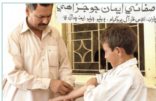
Hepatitis Vaccination Camp in Sanghar, 11 May 2007

The Programme Implementation Unit (PIU) team in Sanghar actively supported the District Government in organising a vaccination camp against Hepatitis at Village Chaudhary Barkat Ali on 11 May 2007. The purpose of the camp was to provide protection to the people of the area against the imminent threats of Hepatitis and provide advice on preventive measures against the possible infections. The staff joined hands with the District Government in bringing the people, particularly women and the elderly people, to the camp by providing transportation facilities. The event was an opportunity to sensitize people about sanitation issues and to disseminate information about the Indus For All Programme.