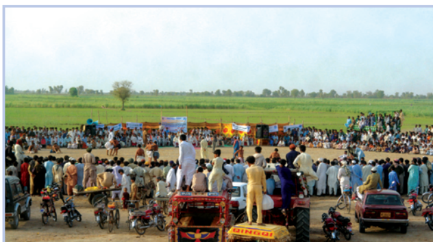
Local festival in Sanghar pulled a large crowd during the daylong event

At the start, PIU Chotiari team organized a tree plantation activity for the general public at the site and arranged 1000 saplings of local species. Before the distribution of plants, participants were sensitized about the importance and significance of trees.