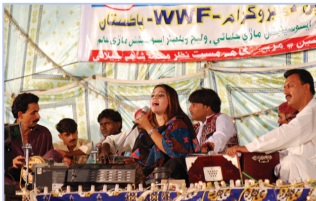
Famous folk singer, Sanam Marvi, performing during the local festival