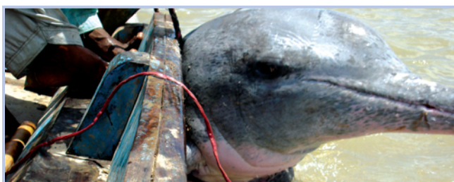
The tied dolphin before being released