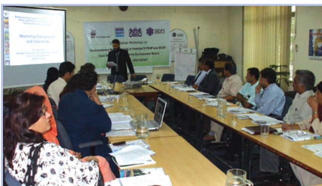
Group work was one of the important segment of the Youth Training Workshop

"A consultative workshop on Environmental Mainstreaming in Pakistan's PRSP and Medium Term Development Framework (MTDF): Case Studies on the Poverty Environment Nexus, was held on the 27 May 2008 at the Sustainable Development Policy Institute in Islamabad. This was the first in a series of policy-level dialogues that will be conducted over the next few years on integrating poverty-environment issues into Pakistan's economic policies and plans. A total of 30 of stakeholders from Government departments, civil society organisations, research institutions and donor agencies attended the workshop. The existing policy context, the existing knowledge base on poverty-environment relationships, and tools to enable integration of poverty-environment issues were the core themes deliberated upon during the workshop. This workshop provided an opportunity for stakeholders to gather at a single forum and express their views on environmental mainstreaming efforts in Pakistan. A total of thirteen minor and major recommendations were made during the workshop. Major recommendations raised at the workshop include establishing a poverty-environment forum that would facilitate improved coordination amongst stakeholders for integrating poverty-environment issues, planning a collaborative (Government of Pakistan and civil society) workshop to finalise poverty-environment indicators and strengthening Ministry of Environment's role in managing and disseminating various types of environmental data.