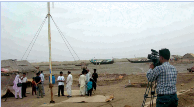
Journalists interviewing villagers during the exposure visit to Keti Bunder

The visiting journalists were taken to a village namely Babu Dablo where they had an interaction with local communities. The community members informed the journalists about the environmental problems in the area especially sea intrusion attributed to reduction in the flow of River Indus into the delta, and destructions caused by cyclones. In addition, the journalists also came to know about the loss of livelihoods in the area due to the desertification agricultural lands, depletion of mangrove forests and decline in fisheries resources. The participants also observed the different initiatives taken by the Indus for All Programme.