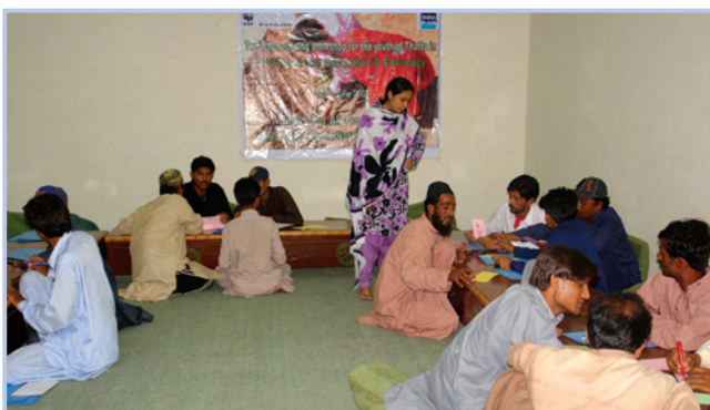
Group work was one of the important segment of the Youth Training Workshop

Nominated by local CBOs of the respective sites, 22 participants including 20 boys and 2 girls participated in the training. Out of the 22 participants, 12 were from Keenjhar Lake area while 08 youths represented different areas of Keti Bunder.