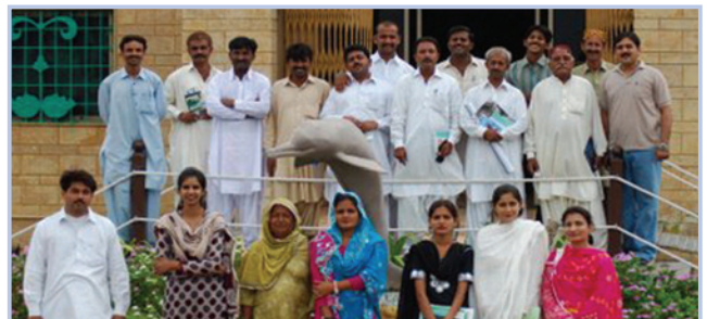
A group photo of the community members and WWF-Pakistan staff at the Wetlands Centre, Karachi, during the visit