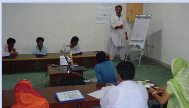
A view of the training of CBO representatives

The Indus for All Programmes endeavours to develop local capacities through its capacity building programme intended for the staff as well as Programme partners. In this connection, the Programme organised Organisational Management trainings for its partner community based organisation (CBO's) during the months of July and August 2008. In total, 137 office bearers of 33 CBOs from the four sites attended the trainings, which were conducted at the Programme sites. The trainings relied on module developed on the basis of training need assessments of different stakeholder institutions. The overall aim of these trainings is to assist institutional development in areas such as planning, decision-making, monitoring as well as setting long-term objectives for the well being of people.