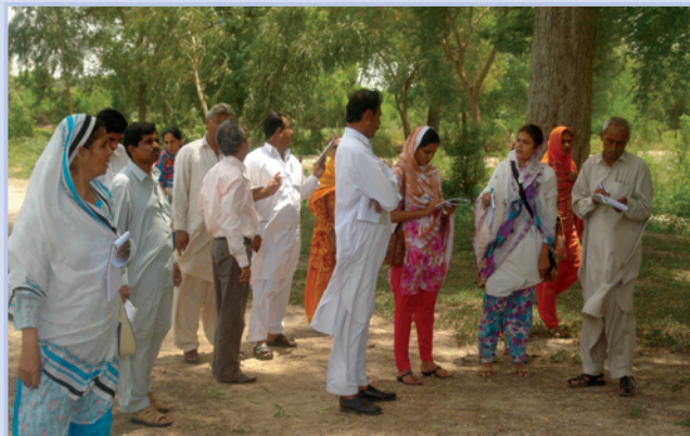
Field visit was an important part of the Master Trainers' Training

The Programme organised a five-day Training Workshop for Master Trainers in Environmental Education from 26-30 August 2008. The venue of the workshop was Civil Society Club, Hyderabad. Participants included 18 potential teachers (10 Male and 8 Female) from schools and a college of Taluka Sanghar. The purpose of this training was to promote environmental education in schools around Chotiari Wetlands Complex by developing a cadre of master trainers who would further train other school teachers in their respective areas. The training was a mix of a number of indoor and outdoor activities developed keeping in view the needs of the diverse set of participants belonging to different areas and backgrounds. A visit to Miani Forest was also organised for the participants for gaining hands-on experience.