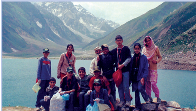
The students of Sanghar were happy to be with other students from all over the country at Lake Saiful Maluk

Installation of Solid Waste Management System at Lake Saiful Malook, Interaction with Tourists and Hut Keepers for Environmental Awareness and Wakeup Walks to boost participants' enthusiasm for nature conservation.