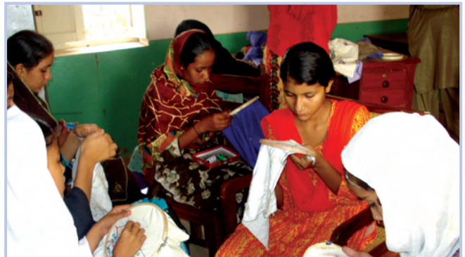
Local women preparing handicrafts in a vocational centre, established with support by the Programme

The Programme has also embarked upon initiatives of providing skill development techniques to women through vocational centres. In this connection, two vocational centres in Keti Bunder and Keenjhar Lake area have been established.