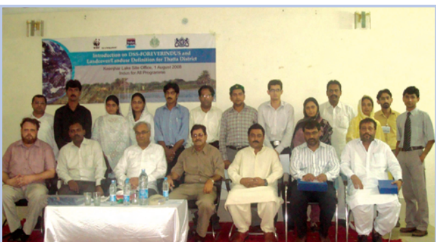
Group photo after the concluding ceremony of the series of GIS workshops

A series of weeklong trainings on “Geographic Information System (GIS) Concepts and Tools for Sustainable Resource Management” were organised from 14 July to 01 August 2008 in Sanghar, Shaheed Benazir Bhutto (Nawabshah) and Thatta districts. Officials from different partner institutions including government departments—such as Sindh Forest & Wildlife, Board of Revenue, Sindh Irrigation & Drainage Authority, and Fisheries & Livestock—attended the training.