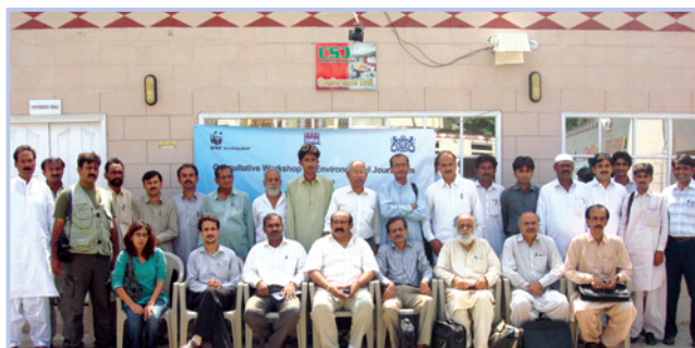
A significant number of journalists from different cities took part in the workshop

The establishment of the Indus Journalists' Forum was the highlight of the workshop. The forum is aimed to promote continued interaction among media professionals engaged in environmental journalism.