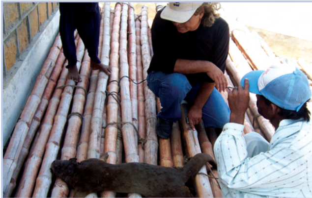
Programme staff examining the dead otter found at Keenjhar Lake area

A dead male Otter ( Lutrogale perspicillata ) was found at Sonda village near Keenjhar Lake on 01 August, 2008. According to IUCN's Red List otter is vulnerable and also enjoys protected status under both CITES (Appendix 2) and the Sindh Wild Life Ordinance 1972. This is the first time ever that an otter has been found in the surroundings of the Lake. The animal was ran over and killed by a speeding vehicle on the road during night time. WWF-Pakistan and the Sindh Wildlife Department are collaborating for more interventions regarding otter conservation.