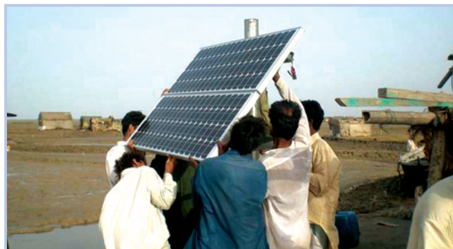
A solar panel being installed at a village in Keti Bunder

The schools have been given 400 watt units which can run two energy saving bulbs, two wall fans and a computer, simultaneously. Similarly, the mosques have been provided with 200 watt units that can run two lights, two fans, and a loudspeaker. The initiative is part of an overall collaboration between the Indus for All Programme and PCRET which will also be providing biogas plants to households at the Programme sites with good population of livestock. The HSBC Bank Middle East Limited is also supporting a project to install biogas plants to the Programme areas. These initiatives will surely reduce the burden on natural resources in the areas.