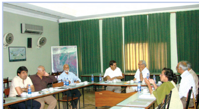
Programme Director briefing the chairman of the Partnership Fund's Technical Committee during the meeting