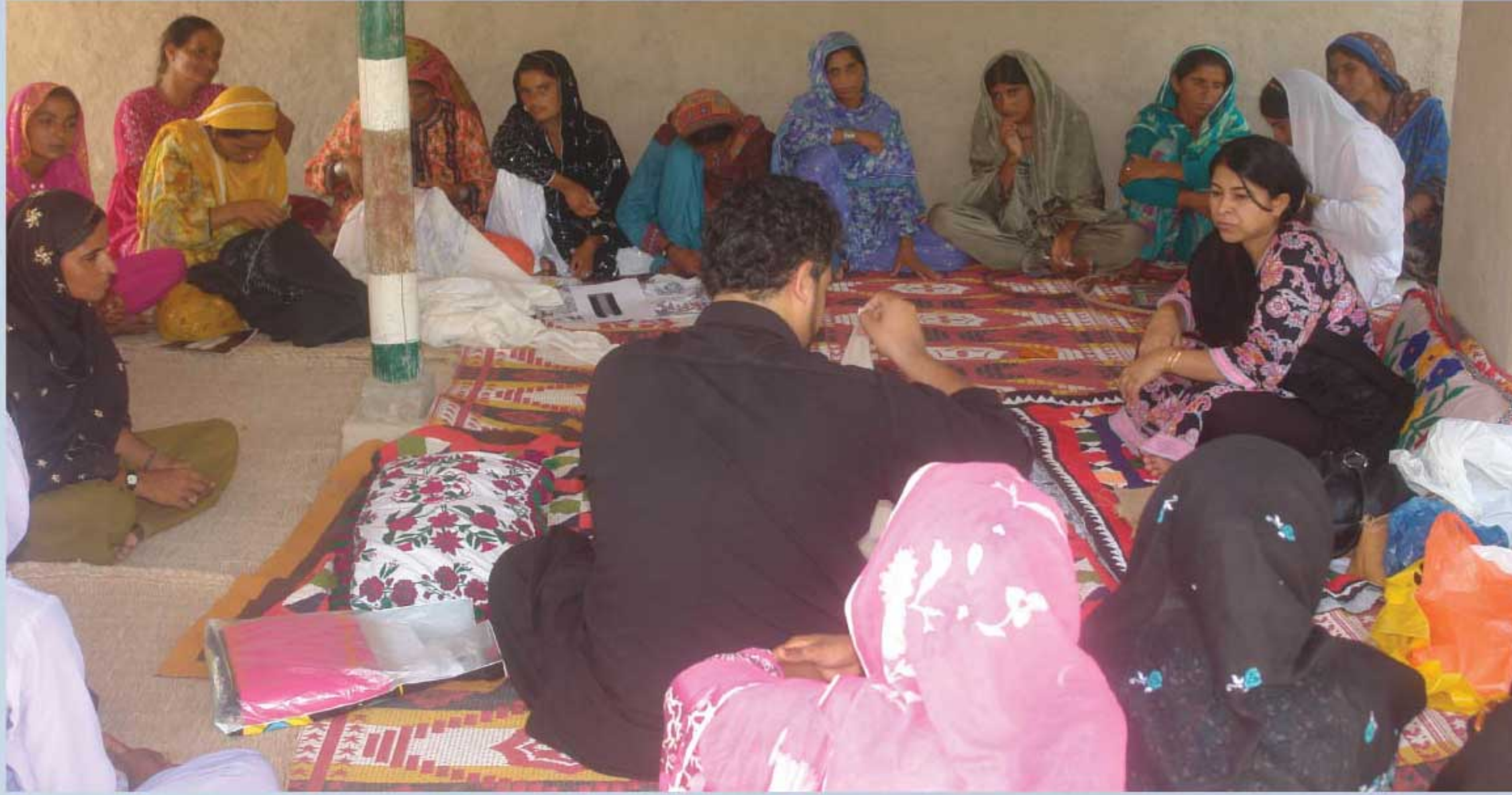
Local artisan women of Chotiari Site getting training in hand-made product development