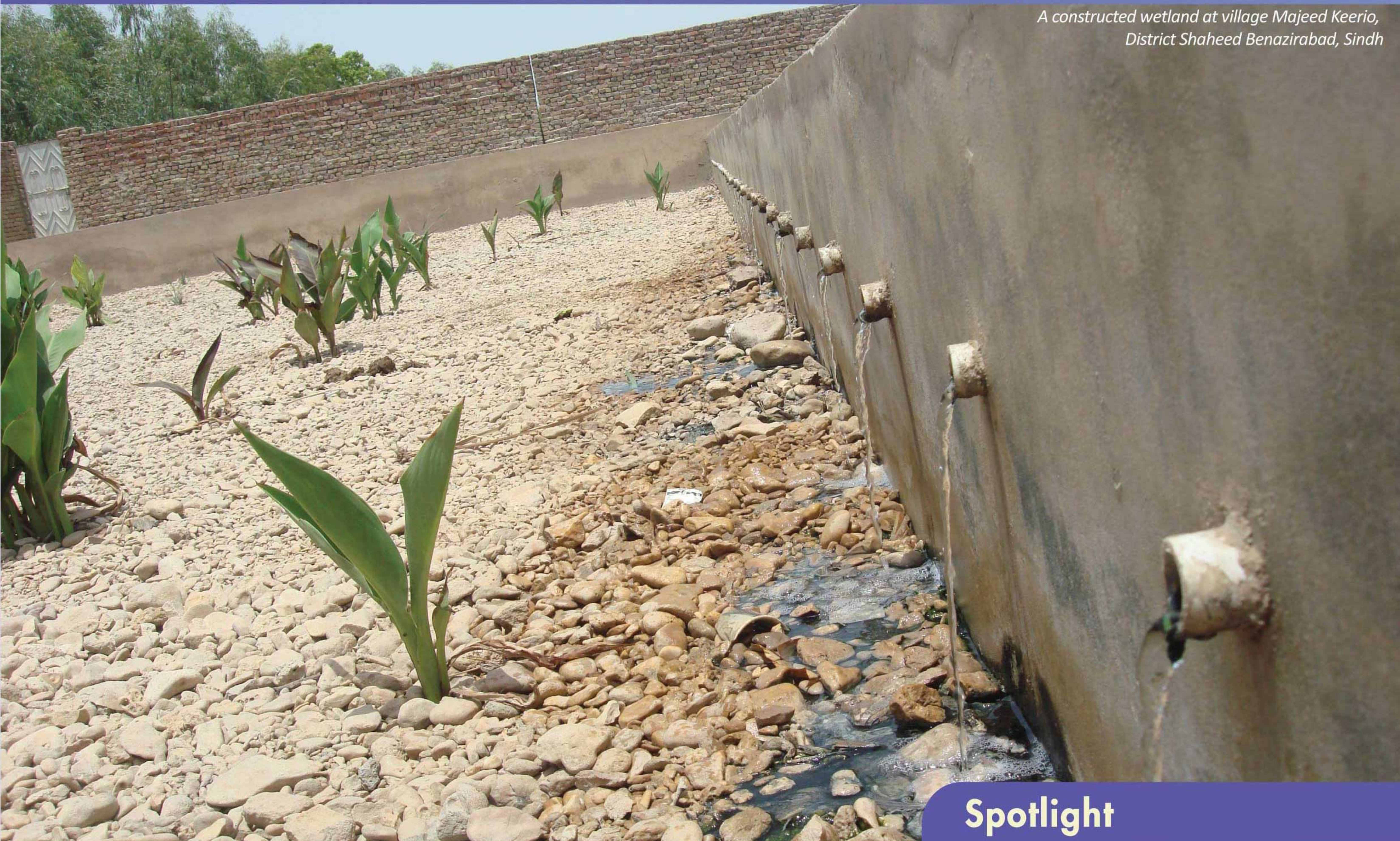
A constructed wetland at village Majeed Keerio, District Shaheed Benazirabad, Sindh

Funded by the Embassy of the Kingdom of the Netherlands in Pakistan, the Programme is being implemented by WWF – Pakistan in close collaboration with the Government of Sindh. The Programme aims to conserve rich biological diversity of the Indus Ecoregion through livelihoods improvement of the local communities. The newsletter aims to keep stakeholders, other concerned organisations and individuals updated about the activities, progress and future endeavours of the Programme.