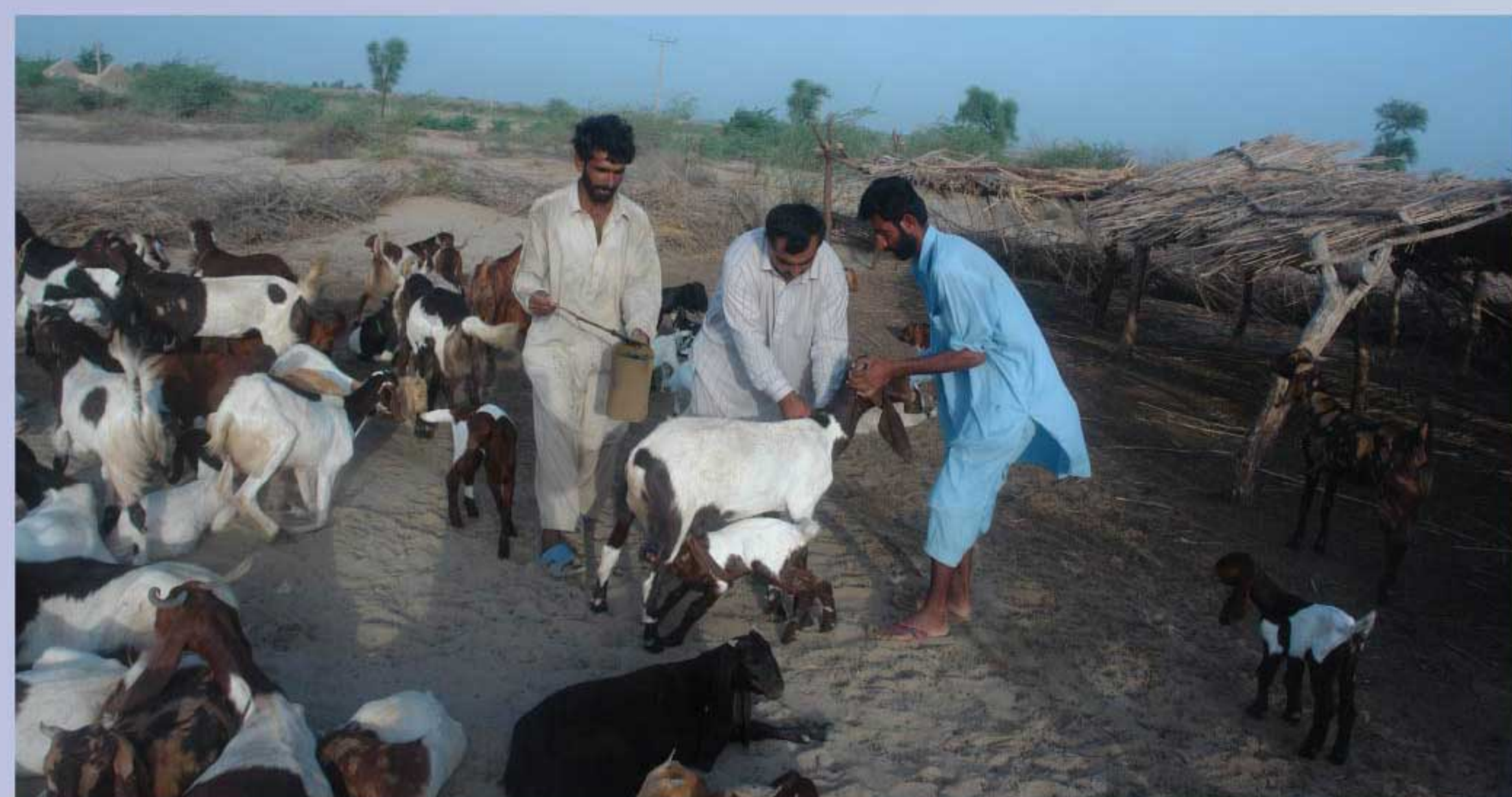
A herd of goats being vaccinated at Chotiari

Thousands of livestock were vaccinated during a seven-day makeshift livestock vaccination camp. The PIU Chotiari Wetlands Complex organised the camp in collaboration with officials of the Livestock Department of District Sanghar.