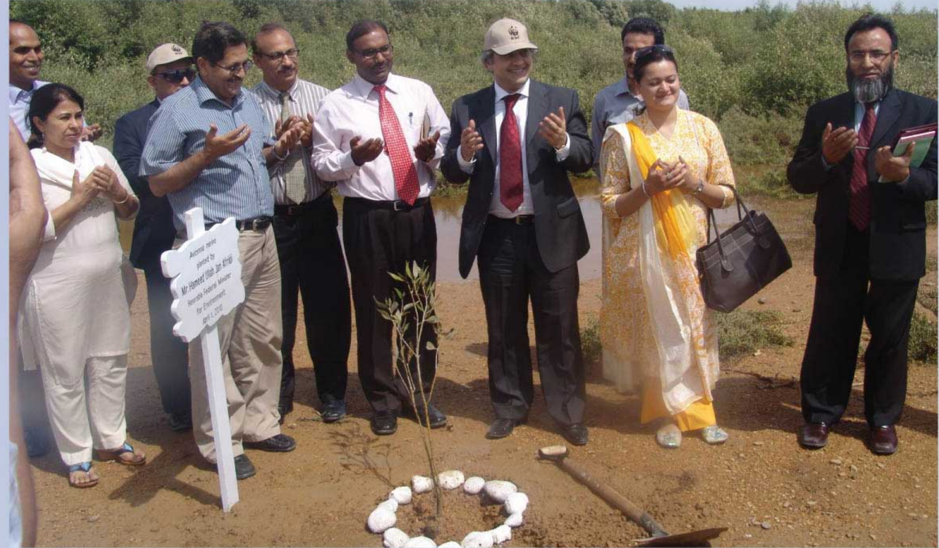
The Minister with WWF's team after planting a tree near the Centre