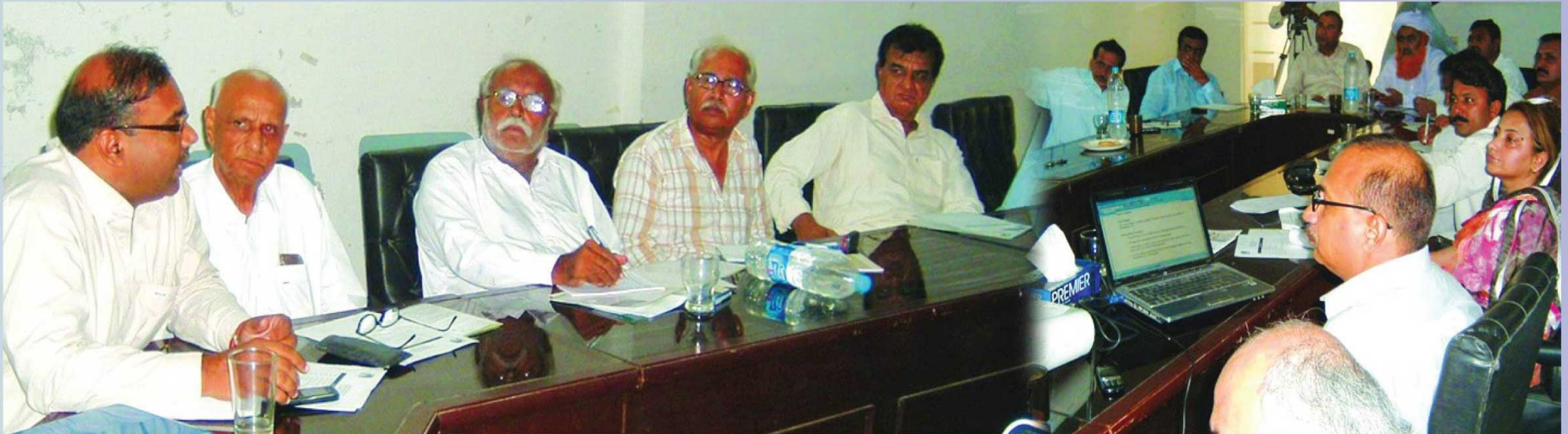
Friends of Indus Forum members meet in Hyderabad

Representatives of the Friends of Indus Forum have urged the government to declare the Indus Delta a fifth shareholder, in addition to the four provinces, in the distribution of water.