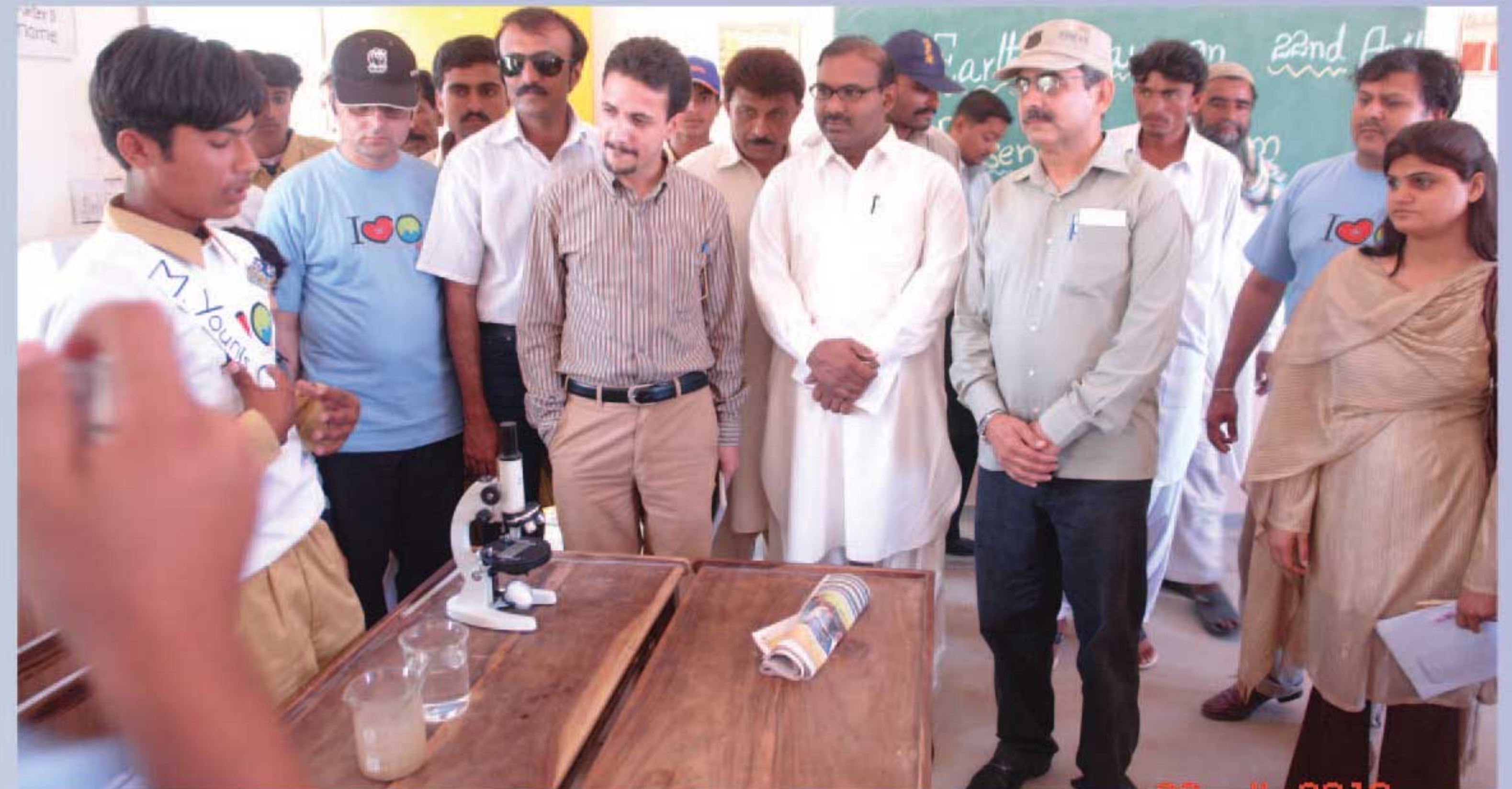
A student of TCF School gives demonstration to participants about the Earth Day 2010.

The mangrove forests and mudflats in coastal area of the Keti Bunder have fallen victim to the sea intrusion, which has swallowed over 200,000 acres of farm land. "Reduced flow in the Indus River has played havoc with the Indus Delta and its ecology", he added.