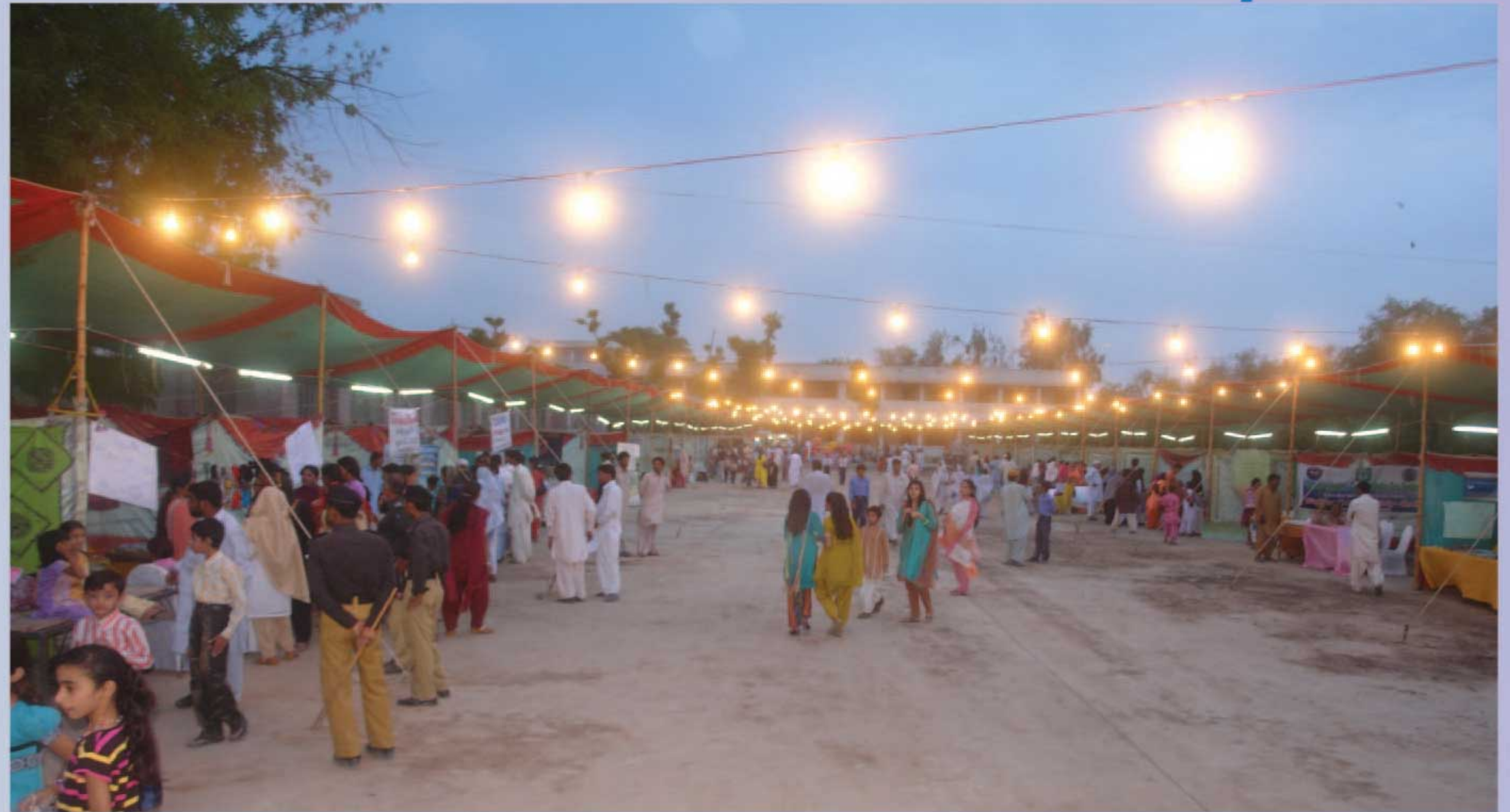
A view of the Pai Nature Festival, held in Nawabshah

A large number of schools and their students from Shaheed Benazirabad and Sanghar District took part in this event