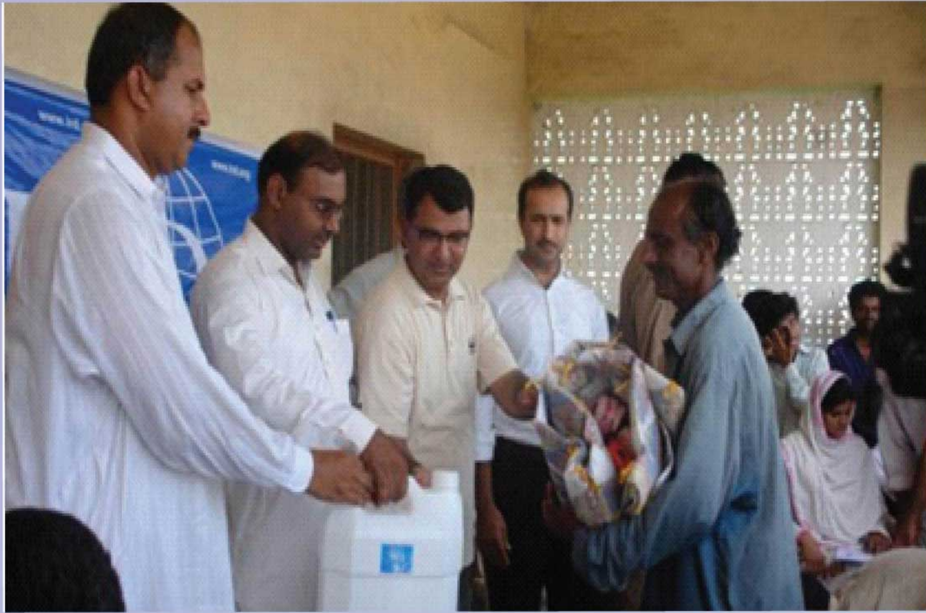
WWF team distributing relief goods among Phet cyclone affectees at Keti Bunder

To mitigate the impact of losses caused by recent Phet cyclone in coastal areas of Thatta and Badin districts, the Indus for All Programme mobilised support from international relief and development bodies, and arranged relief goods, including quilts, slippers, jerry cans, and water purification tablets for the cyclone-hit locals.