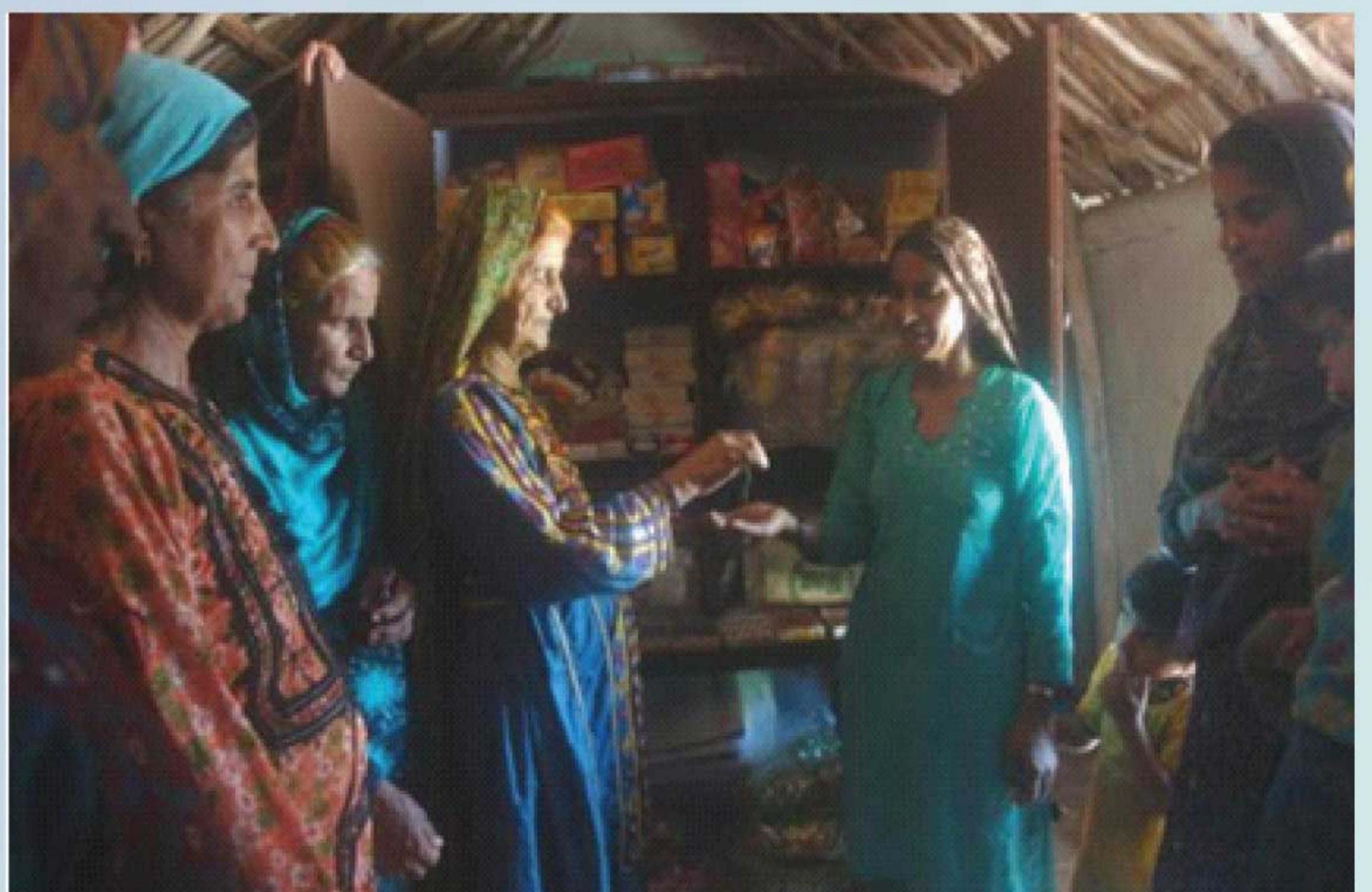
A local woman deals with customers at her shop

In addition to promoting enterprise, these shops will cater to the needs of local women, who frequently have to walk several miles to the distant market to purchase fabric, embroidery thread and other craft materials. The Programme anticipates that these shops will reduce travel time and associated expenses, while building women's capacity to manage small-scale enterprises.