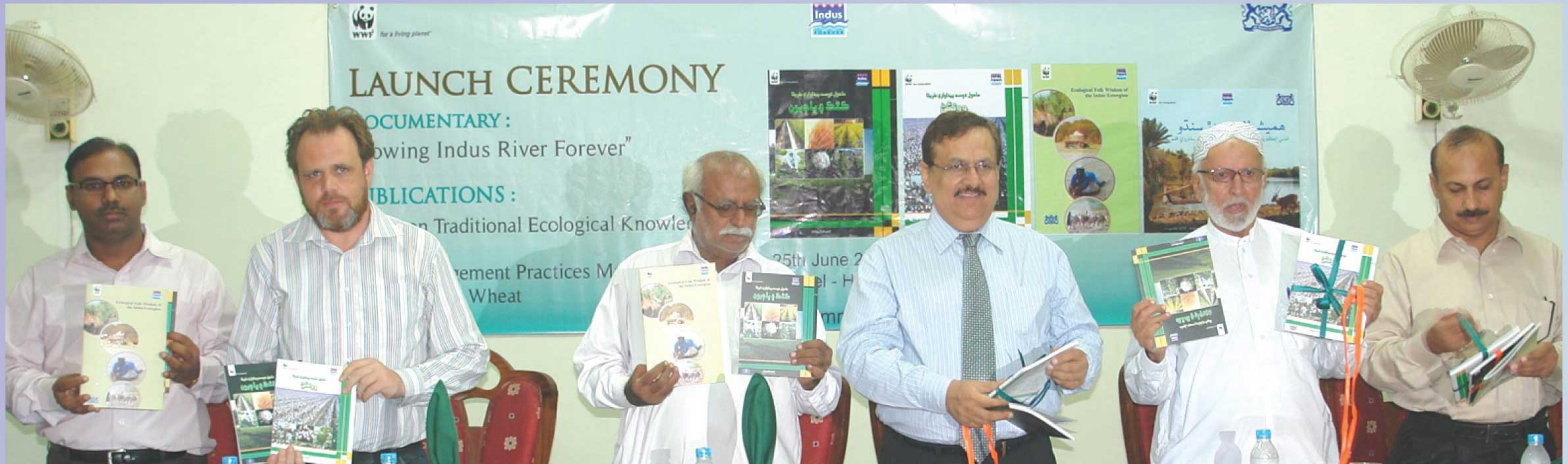
Speakers showing BMPs Manuals and TEK study at launching ceremony