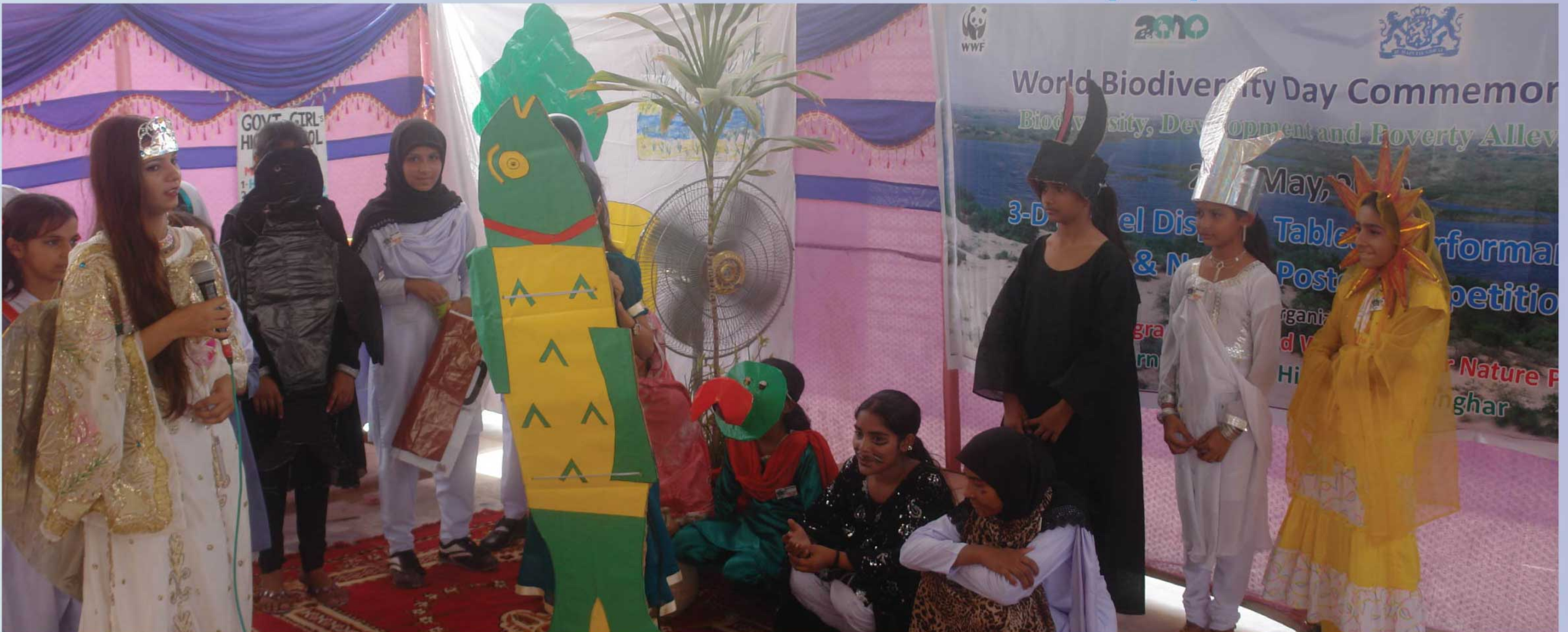
Children perform at the Biodiversity Day 2010

A set of activities were organised around the designated theme of 'Biodiversity for Development and Poverty Alleviation'. Students of four local girls' schools in Sanghar took active part and displayed their 3-D thematic models, posters on nature, and drawings, in which they attempted to highlight importance and present face of the local biodiversity. Prizes, shields and gift packs were also distributed among the winners of the different competitions. Visitors attending the programme included EDO Education, DOs Social Welfare, teachers, members of local NGOs, media organisations, and a good number of families and school children.