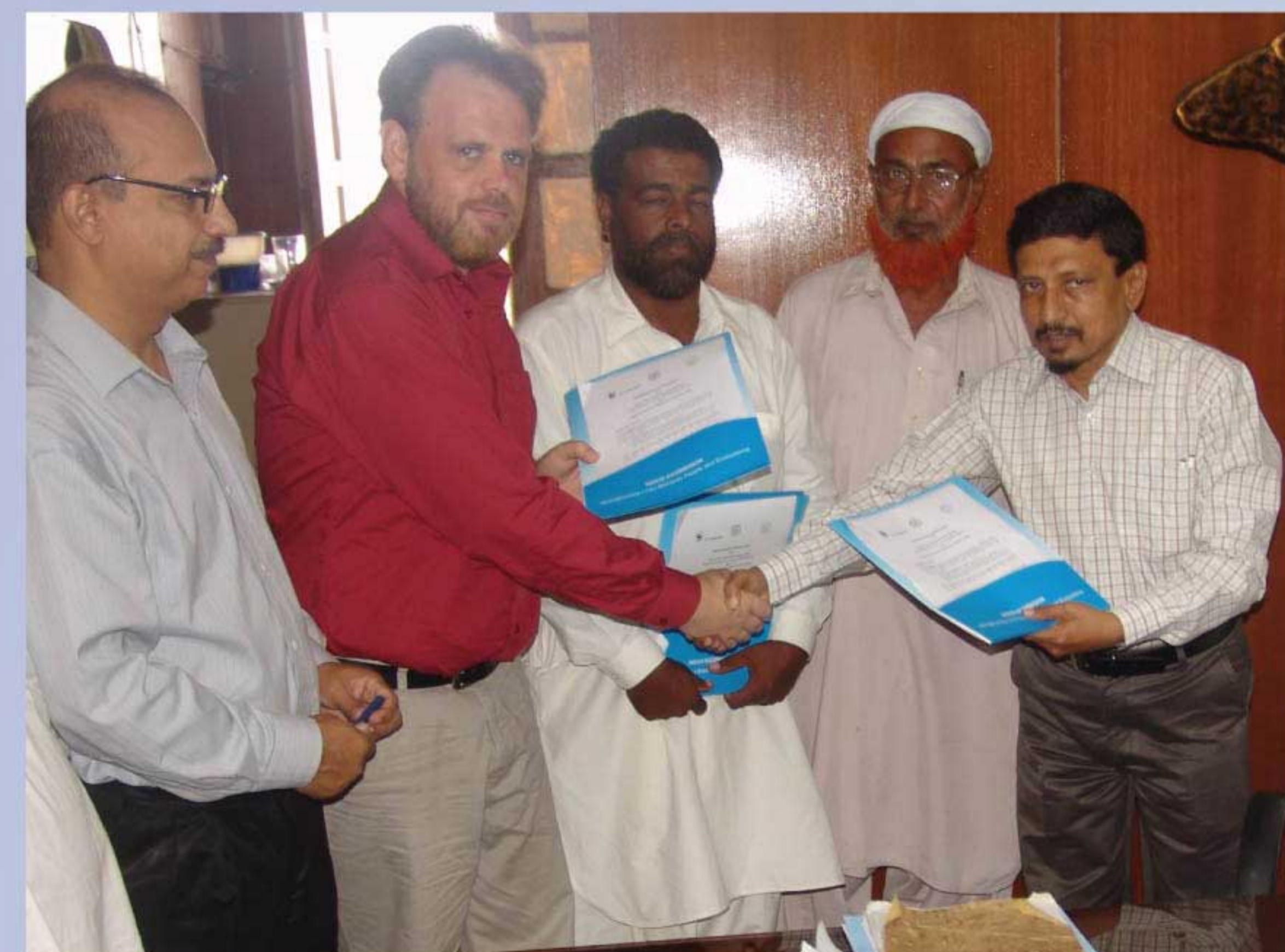
Representatives of WWF - P, KWSB and FDoK at the signing ceremony