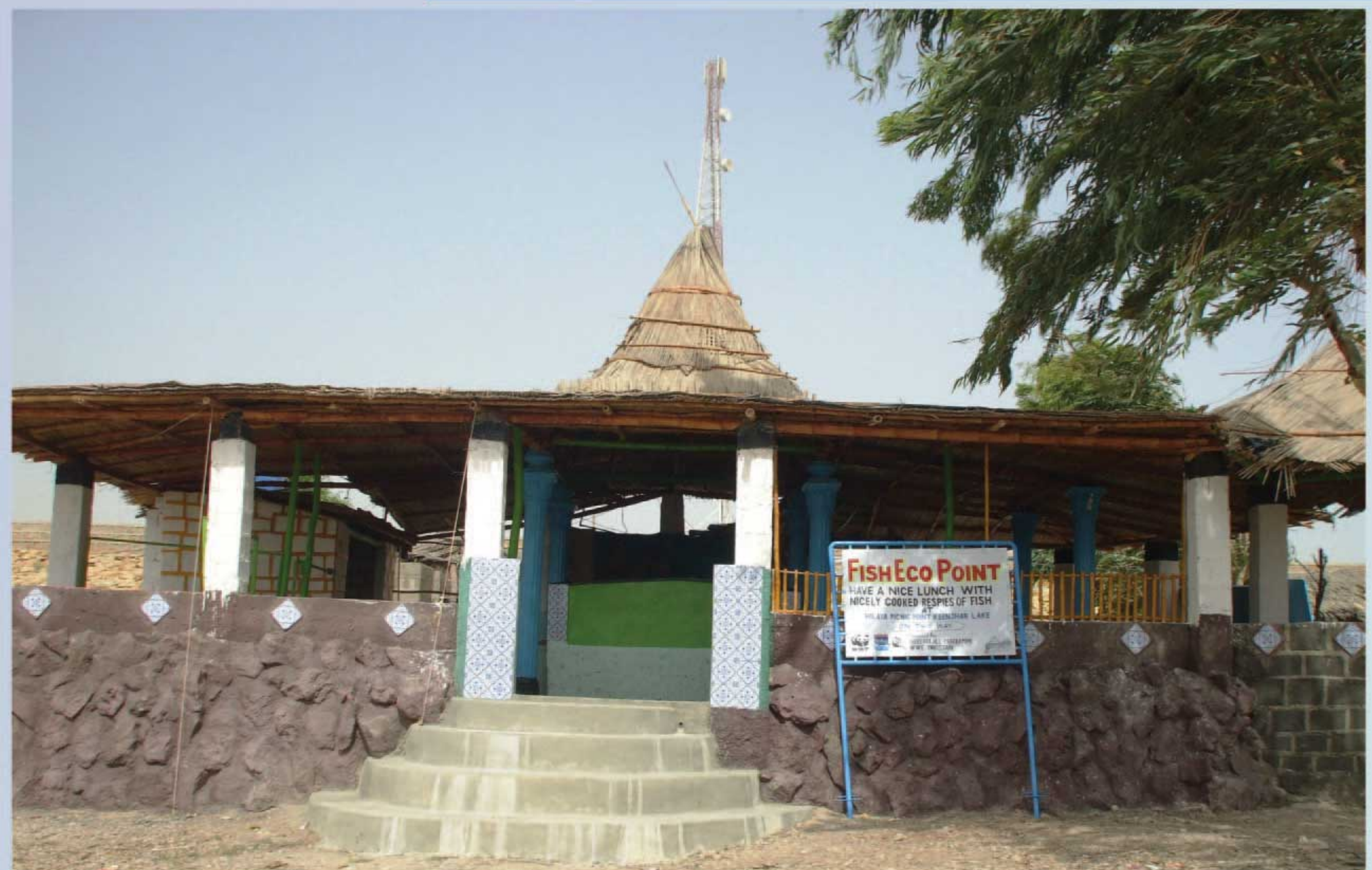
First ever Fish ecopoint built at Hillaya picnic spot, Keenjhar Lake