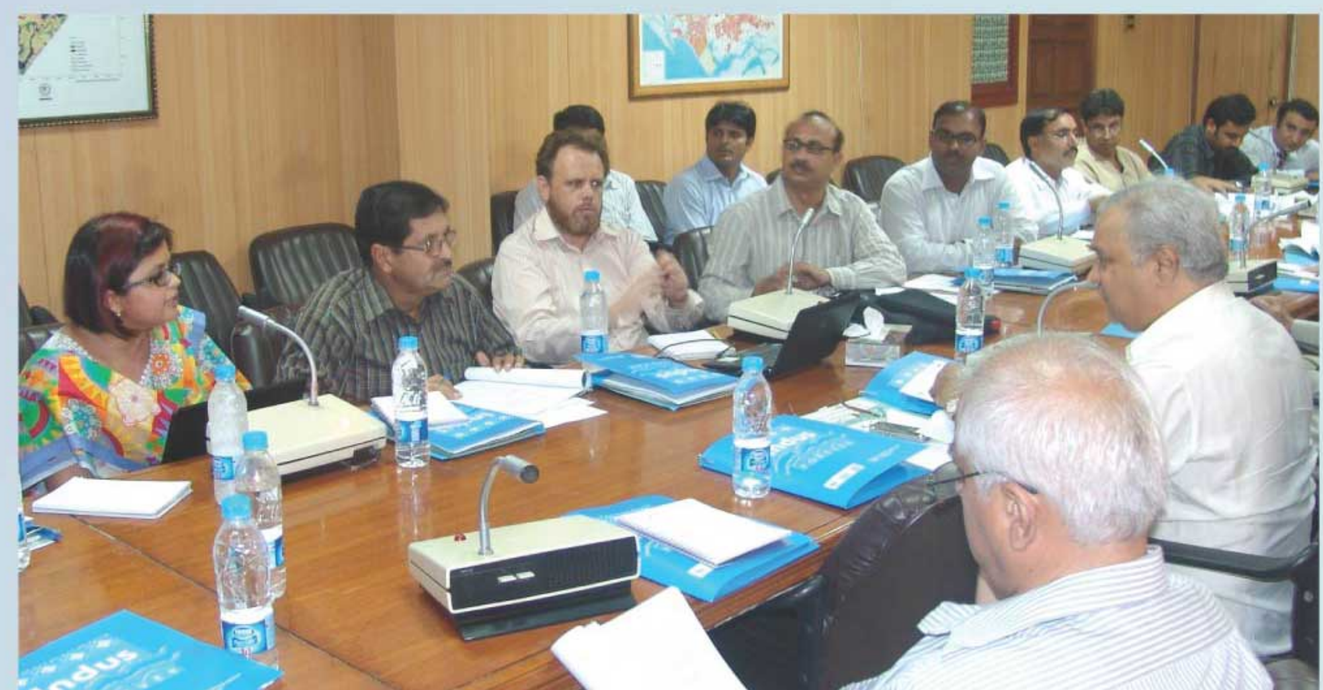
IESC meeting taking place at Sindh Planning & Development Department